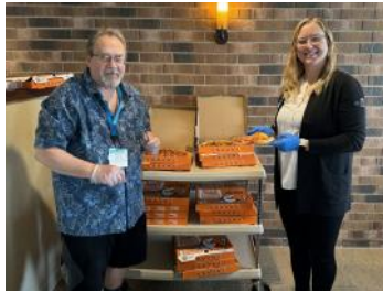
Pizza Pi Day! 3/14