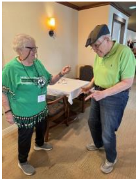
Residents wearing their green attire for St. Patrick's Day!