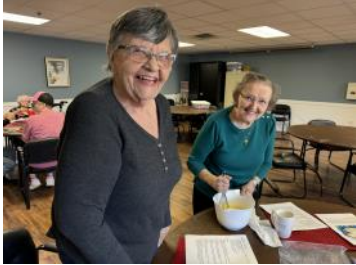
Spring Break Baking!